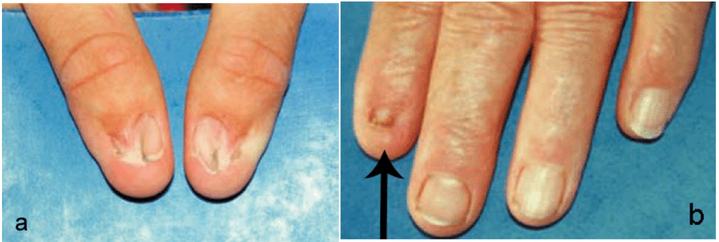
Figure 1. Typical presentation of thumb nails (a) and fingernails (b) in nail-patella syndrome. The arrow points to the index finger. Note decrease in severity of nail involvement from second to fifth finger and lack of creases over the distal interphalangeal joints.

For an introduction to multigene panels click here . More detailed information for clinicians ordering genetic tests can be found here .